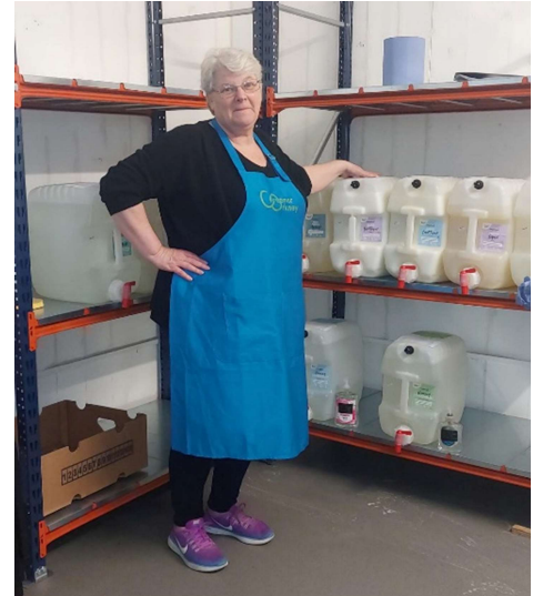
Photo: At the new Greener Orkney Refillery.

Greener Orkney are currently looking for some day-time and evening volunteers to help cover the summer months. Full training is provided. Most of our long-term volunteers do one lunch-time or evening per week or every alternative week. Full details of opening hours are available on the website www.greenerorkney.org.uk