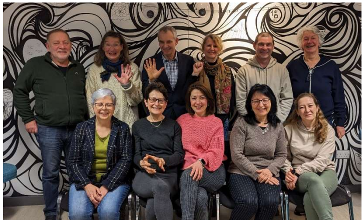
Photo: Some of the Language Café volunteers and service users.

The Language Café currently has 8 volunteers who give their time every Saturday to run the informal two-hour session. Meetings are held at the Orkney Youth Café which is the perfect place for creating a relaxed atmosphere with enough space to break out into smaller groups, as well as space for children to play while their parents are learning.